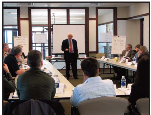
The Radical Lessons in Leadership Workshop, as well as other DMMC training opportunities, foster leadership development and an understanding of municipal issues.