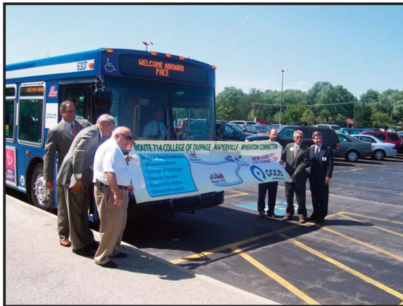
The COD Connector service started in August 2006. Ridership has reached 240 passengers per day.

Significant progress has been made in implementing the DuPage Area Transit Plan since its adoption in September 2002. During the past year, route designs and operations were finalized for the College of DuPage (COD) Connector, the first route to be implemented as part of the Transit Plan. Pace service began in August 2006, and a team of stakeholders continues to meet monthly to market the route.